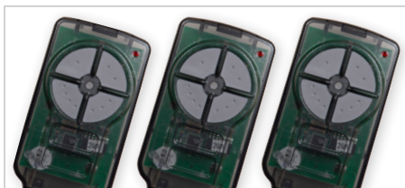
Three TrioCode™128 Remote Controls

When maximum spring balanced weight is 20kg.