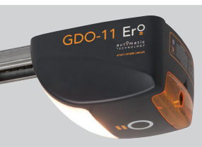
Opener with Courtesy Light